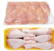
Processed poultry products popular with consumers

The "Processing chicken meat for cold storage" technology is a streamlined method for poultry processing. It uses mechanized equipment to convert raw chicken into value-added products and includes cold storage for long-term preservation and transport. It's designed for small and medium enterprises, with cooperative models for capital and volume generation.