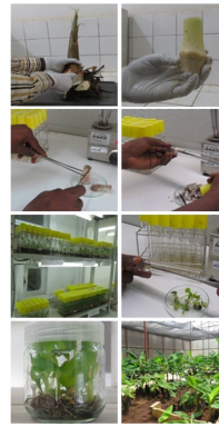
Steps of in-vitro tissue culture micro propagation: a) Removal of sheaths, b) Separated corm, c) Desinfection and segmentation of corm, d) Transferal to sterile tubes with growth media tubes, e) Culturing in climatized chamber, f and g) Transferal of propagules for proliferation of shoots by subculturing in jar, and h) Nursing of plantlets in screenhouse

In-Vitro Tissue Culture Propagation involves a series of steps including initiation, multiplication, shooting and rooting, and hardening, all performed in controlled, sterile laboratory conditions to produce disease-free banana and plantain plantlets.