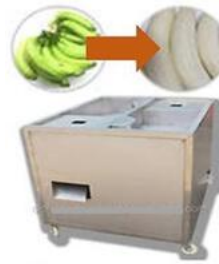
An industrial green banana peeler able to process 600 units per hour

Banana and plantain peels offer a sustainable solution to waste disposal, serving as valuable resources for animal feed, soil input, and cooking ingredients. Proper processing detoxifies the peels, making them suitable for consumption by animals and contributing to waste reduction in regions where plantains and cooking bananas are common.