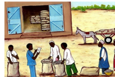
Farmers deliver grain to warehouse, and an officer registers the quantity and quality

The warrantage inventory and credit system is a practical solution for small-scale farmers. It operates through a warehouse receipt mechanism, allowing farmers to store non-perishable crops (such as millet) in secure warehouses. In return, they receive inventory credit—loans against the stored grain.