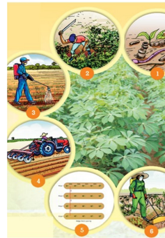
Overview of 6-step approach practices

The “Six Steps Cassava Weed Management” technology is a holistic solution to weed problems in Sub-Saharan Africa’s cassava fields. It provides a decision-making framework for farmers to effectively control weeds, leading to higher cassava yields. This adaptable method caters to diverse farming conditions, enhancing cassava productivity and regional food security.