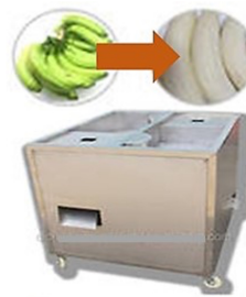
An industrial green banana peeler able to process 600 units per hour

Banana and plantain peels offer a sustainable solution to waste disposal, serving as valuable resources for animal feed, soil input, and cooking ingredients. Proper processing detoxifies the peels, making them suitable for consumption by animals and contributing to waste reduction in regions where plantains and cooking bananas are common.