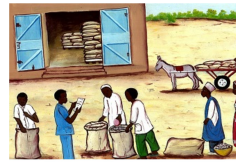
Farmers deliver grain to warehouse, and an officer registers the quantity and quality

The warrantage inventory and credit system is a practical solution for small-scale farmers. It operates through a warehouse receipt mechanism, allowing farmers to store non-perishable crops (such as millet) in secure warehouses. In return, they receive inventory credit—loans against the stored grain.