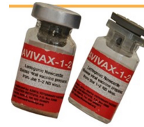
ND I-2 vaccine is available in small vials

The "Universal Vaccination against Newcastle Diseases" is a method for widespread vaccination in poultry. It includes thermostable vaccines, efficient logistics, easy application, and vaccinators training.