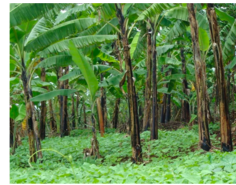
Banana with common bean understorey

Improved system production for better yield