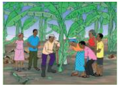
De-suckering: Removal of excess suckers to maintain optimum plant population per mat. Leave 3 plants per mat.

Plan to manage your banana plantation using resources within and around banana cropping systems